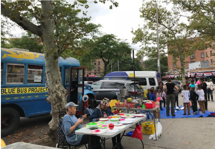
Children think creatively during The Blue Bus Project with Artist Annalisa Iadicicco at Queensbridge Houses in 2018.

Intergenerational trauma is present throughout public housing. In addition, public housing residents are disproportionately impacted by health and wellness challenges due to structural injustice. Arts and culture promote resilience and healing, build empathy, create space for reflection, and amplify efforts to ensure optimal health and wellbeing for all.