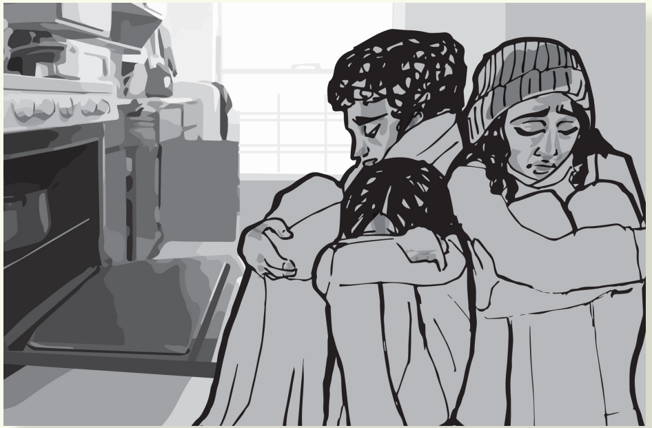
CVH Vision illustration for a "State of NYCHA" action.