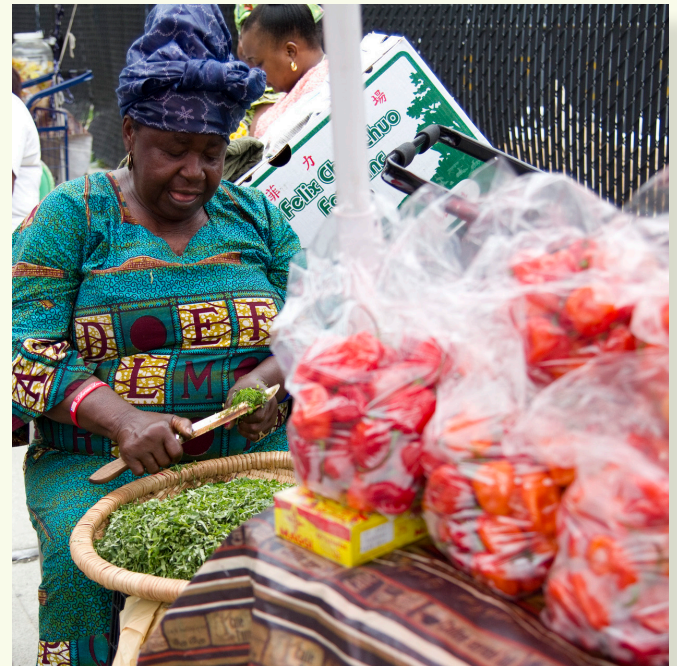
A grandmother and vendor at Park Hill Community Market.

West African Immigrants Present an Open-Air Cultural Marketplace