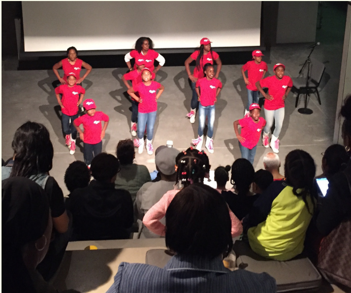
Gowanus Wildcats, a 50 year old youth step team, performs in Soft.

Public housing residents are inadequately represented in community planning and city policymaking. In zoning conversations, for example, they may feel unwelcome at meetings, be left off the map, or have others speaking on their behalf. Arts and culture bring residents to the table to speak in an accessible medium about the issues that directly impact their lives.