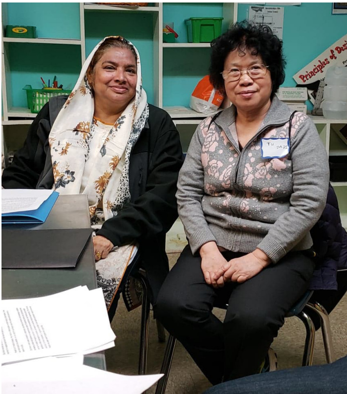
Women gather for a Storytelling for Language Justice workshop with CAAAV Organizing Asian Communities.