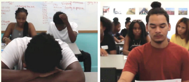
#NO CUTS PSA by Red Hook Initiative Youth.

Youth at Red Hook Initiative Create a Video to Preserve HUD