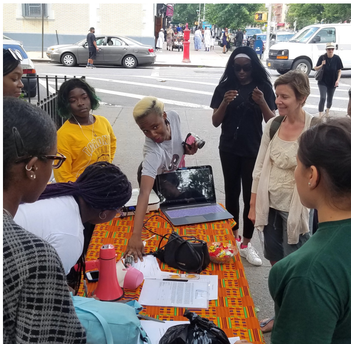
Groundswell Activism students engage the Saint Nicholas Houses community in participatory action research.

As part of CreateNYC , New York City’s cultural plan, the Social Impact of the Arts Project (SIAP) affirmed that arts and culture have a significant impact on the social wellbeing of New York City neighborhoods.